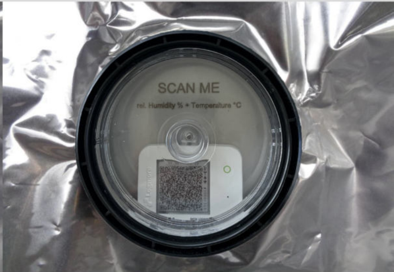
with dynamic QR code