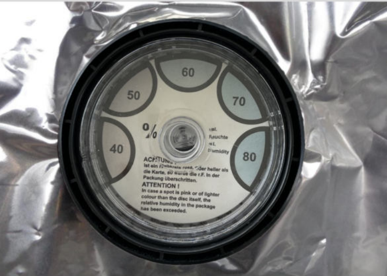
with indicator card

Can be screwed in connection with aluminum composite foil to monitor the relative humidity